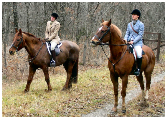
Major and Gabe