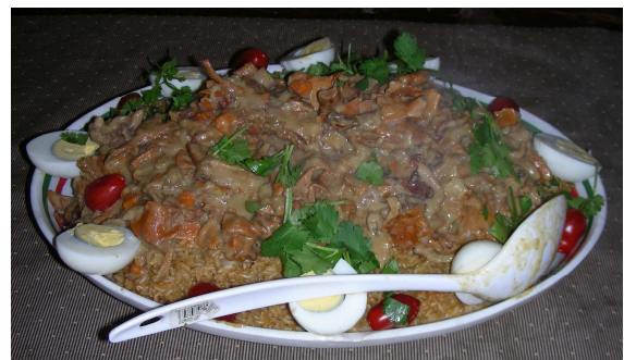
Vegan Curry and saffron rice Chanterelle kedgerree

We who ride horses across country are natural conservationists so it in and of itself is worthwhile but it is also most complimentary to showcase another great Feature of our Hunt country and with a great group of folks.